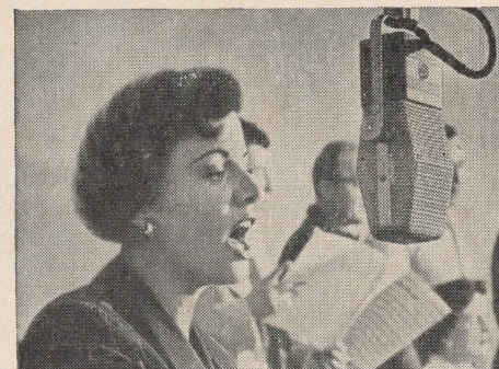
THE PERFORMER—The Big Session—Kay puts it on wax.